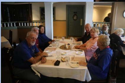
Tavern on the Ridge Rest.